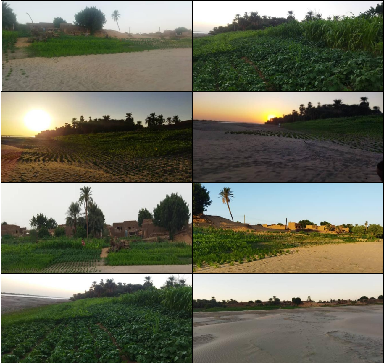
Fig 3: Photos from Kori

The study of El-Tahir et al. 2024 [6] in Agoreer area in the Northern State revealed a large number of shared samples between the two areas of Kori and Agoreer.